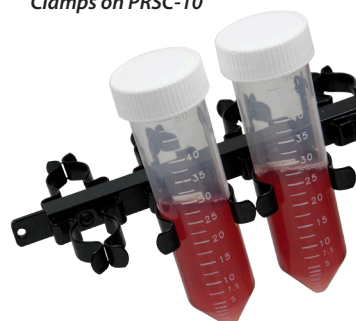
Clamps on PRSC-10

PRS — series platforms are equipped with universal rubber clamps for different size tube fixation;