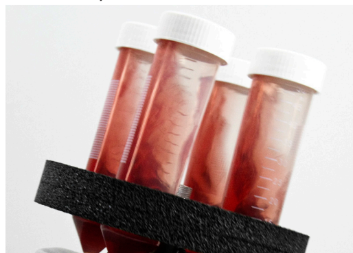
MSV-3500 with platform SV-4/30