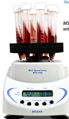
MSV-3500 with platform SV-8/15

For separate platforms catalogue numbers see table below